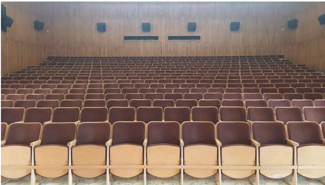
View of the seats from the stage