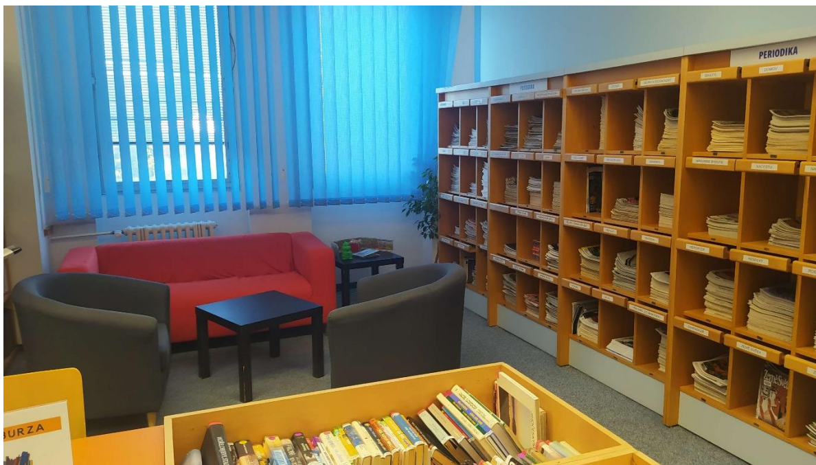
A third reading area, with magazines on the right