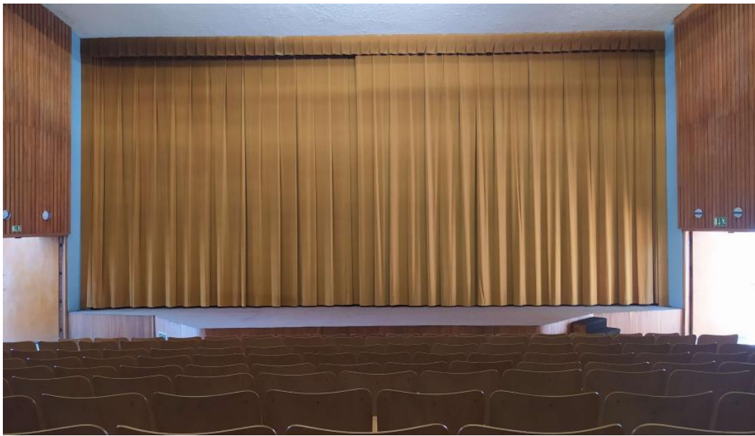
View of the stage from the viewer's perspective