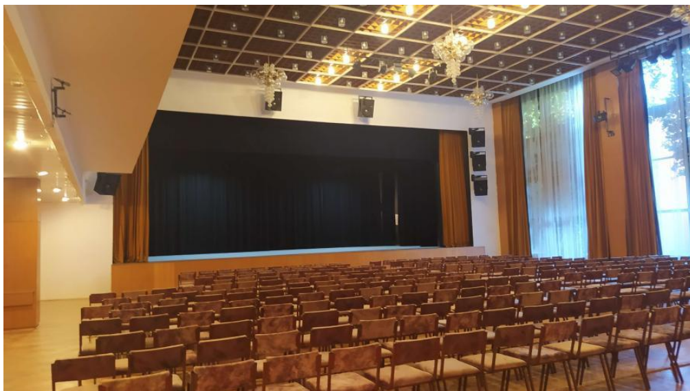
Big hall within the House of Culture