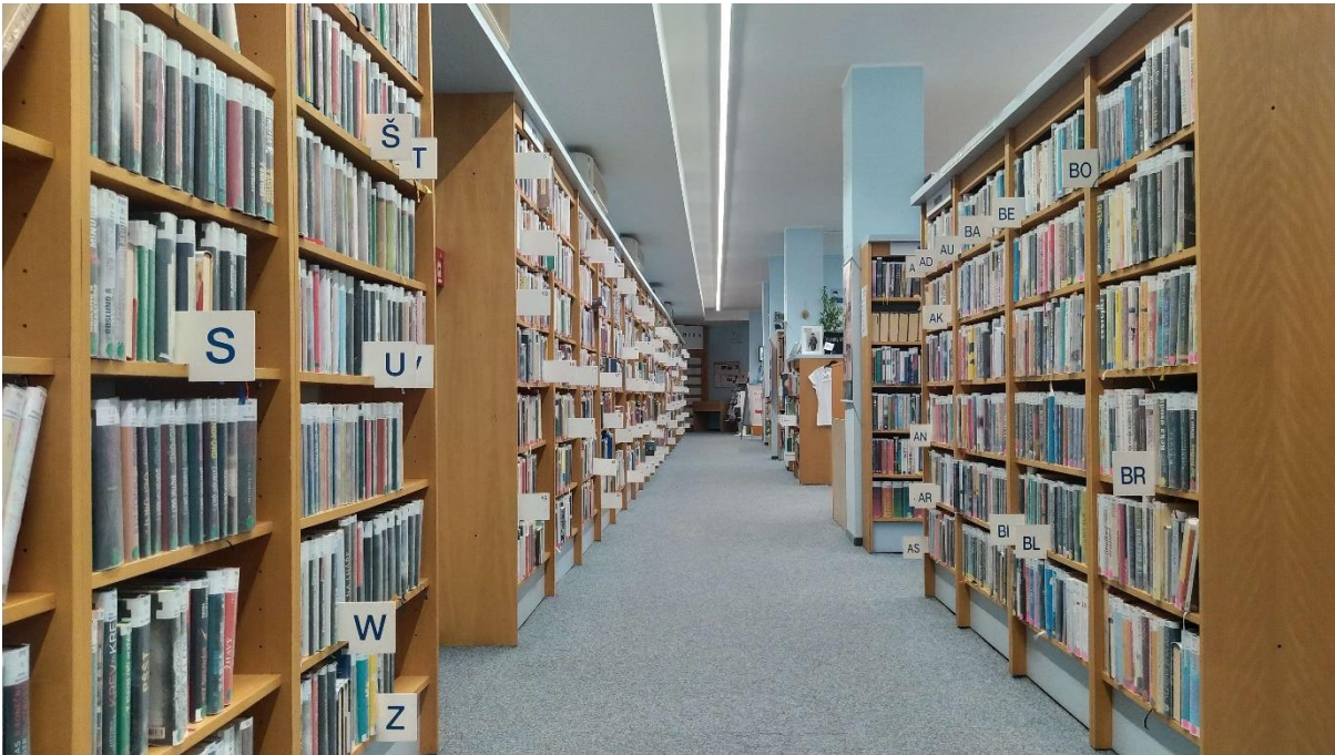
View of the entrance from the aisles