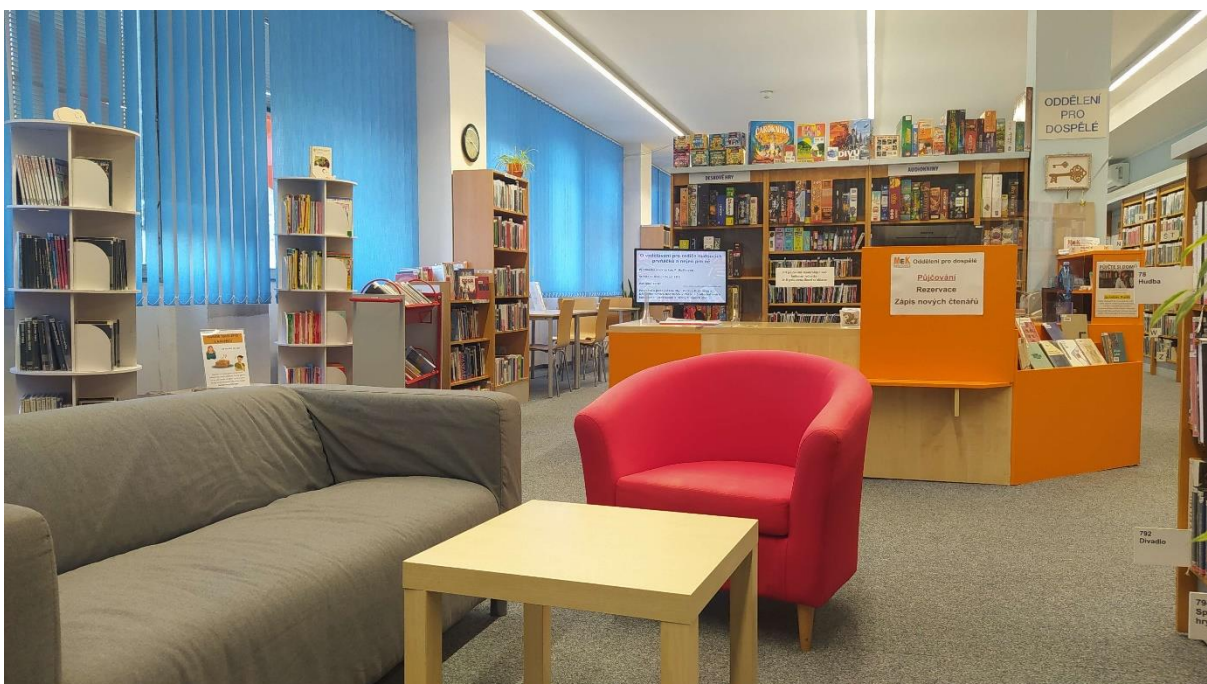
One of many dedicated reading areas